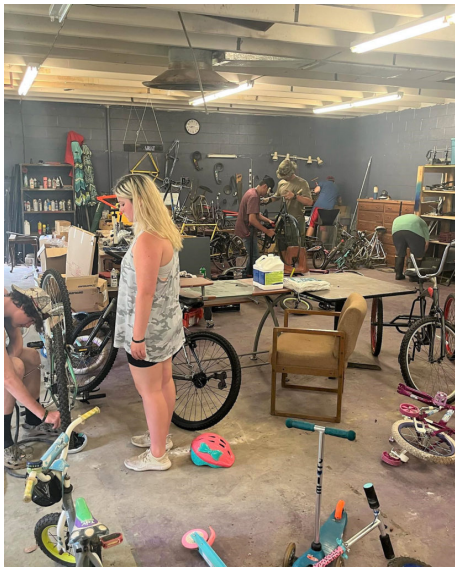
BIKE MINISTRY – Soul City Church in midtown Jackson operates a bicycle shop where neighborhood youth and can own a bike after putting in at least six hours to restore it.

Th e bi cy cl e sh op gi ve s aw ay do na te d bi cy