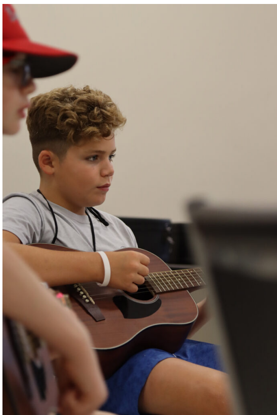
A Summer Music and Arts Camp for Kids camper learns how to play the guitar during an afternoon worship arts session.